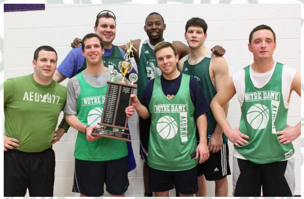
Back-to-back alumni basketball tournament champions - Class of 2003