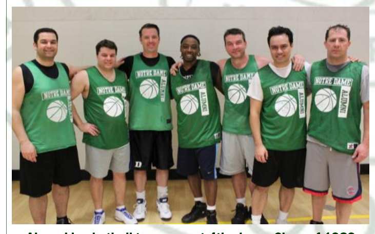
Alumni basketball tournament 4th place - Class of 1989