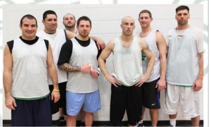
Alumni basketball tournament 3rd place - Class of 1999